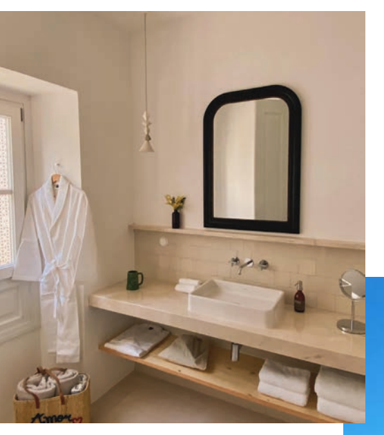
The finishing touches are coming together, slowly but surely and ever-so-beautifully. Guests are already looking forward to a wonderful stay surrounded by favourite things